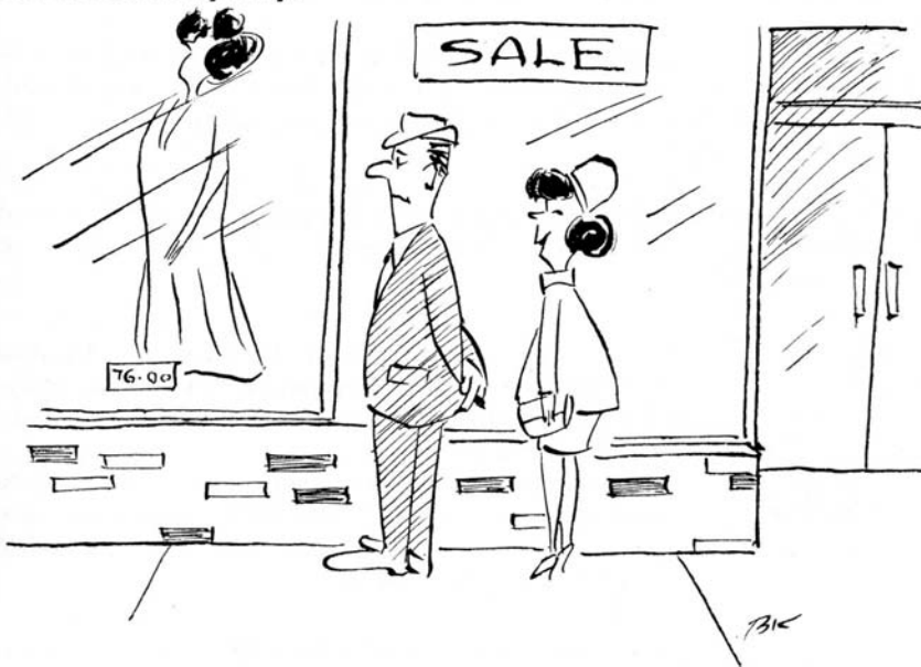
"Let's spend some of that booze money, now that you're sober!"